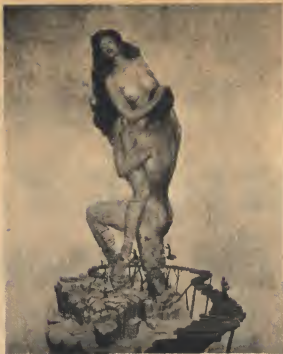
MAN AND WOMAN